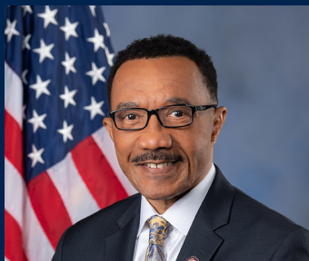
Representative KWEISI MFUME Parliamentarian