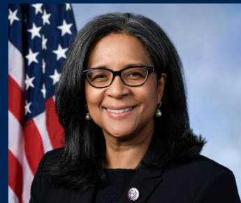
Representative MARILYN STRICKLAND Whip