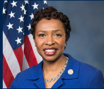
Representative YVETTE CLARKE First Vice Chair