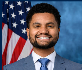
Representative MAXWELL ALEJANDRO FROST Member-at-Large