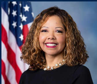
Representative LUCY MCBATH Secretary