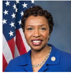
Rep. YVETTE CLARKE First Vice Chair