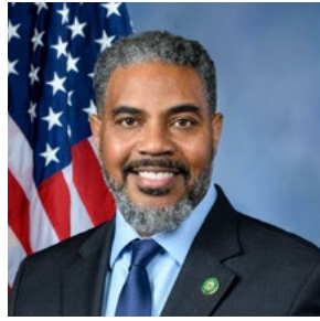
Rep. STEVEN HORSFORD Chair