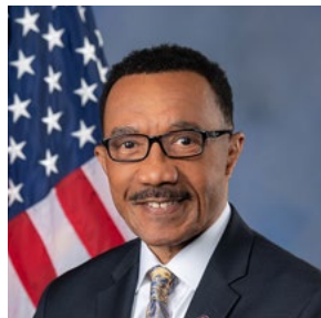
Rep. KWEISI MFUME Parliamentarian