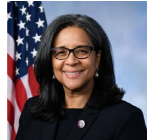
Rep. MARILYN STRICKLAND Whip