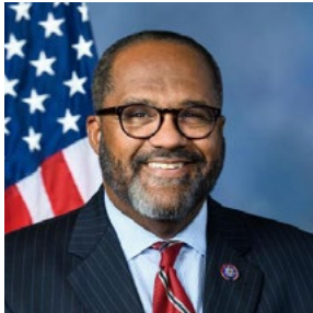
Rep. TROY CARTER Second Vice Chair