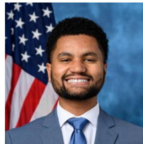
Rep. MAXWELL ALEJANDRO FROST Member-at-Large