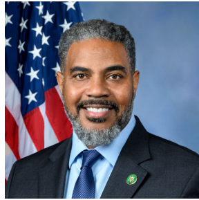
Rep. STEVEN HORSFORD Chair