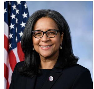
Rep. MARILYN STRICKLAND Whip