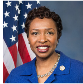
Rep. YVETTE CLARKE First Vice Chair