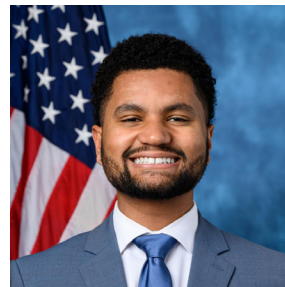
Rep. MAXWELL ALEJANDRO FROST Member-at-Large