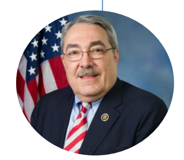
Rep. G. K. Butterfield (NC-01)